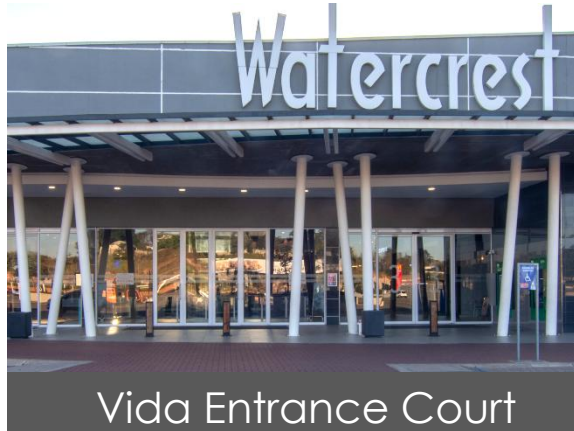
Vida Entrance Court