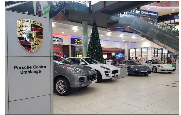
Food Courts 1 & 2