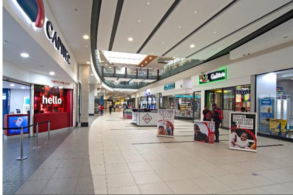
Banking Courts 1, 2 & 3